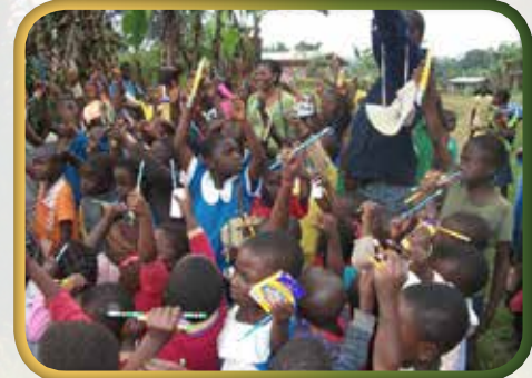
↑ "Bags to School" Outreach. Distributing school supplies to school children in Muambong.