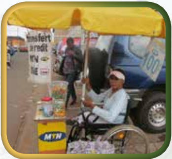
↑ A young crippled woman's life is changed by our small business loan. She is one of many beneficiaries.