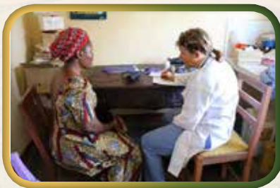
↑ Medical outreach, Mbalmayo