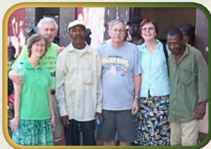
↑ 2013 Jacksonville medical team

and gave gifts to the Mission School of Hope and a Baka pygmy community in Mbang, as well as children at Grace Tait Orphanage in Bossa.