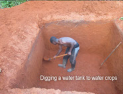
Digging a water tank to water crops