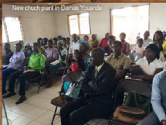
New church plant in Damas Youande