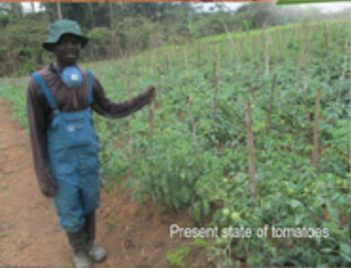
Present state of tomatoes