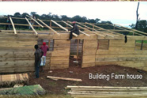
Building Farm house

BFL has embarked on a development project in a 250 acre land among the Baka Pygmy tribe in the East of Cameroon. We have made some progress with very limited resources. We could be doing better with some resources and farm equipment. Our goal is to use this land as a ministry base to reach the Eastern part of the Country and beyond our borders.